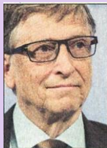
William "Bill" Henry Gates, III (*1955). US-American entrepreneur. Founded the Microsoft company with Paul Allen in 1975 and today is considered to be the fourth richest person in the world with an estimated fortune of 144 Billion US Dollars. Since 2008 he is active in the Bill & Melinda Gates Foundation which he established.