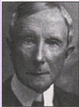
John Davison Rockefeller, Sr. (1839-1937), US-American entrepreneur, first billionaire in world history (in 1916, calculated in US Dollars) and is considered the richest person in modern times. Rockefeller co-founded the oil refinery that became the Standard Oil Company in 1870.

A good example is the Open Society Foundation , a foundation of the billionaire George Soros , that enforces its goals primarily by financing NGOs. For example, several Antifa groups (NGOs) in the USA are financed through the George Soros Open Society Foundation. (2) By the way, those are exactly the Antifa groups that caused the most serious riots in 2020 in order to prevent the re-election of Donald Trump .