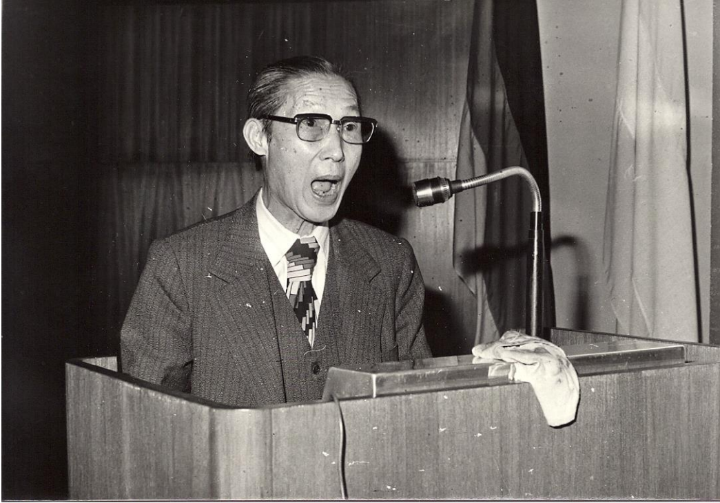
"No, no – listen!"