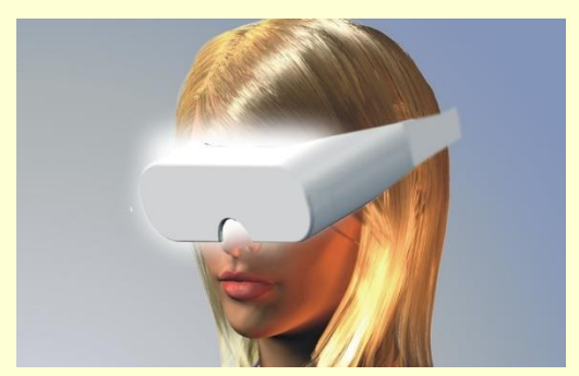
Intensive white radiation 9,000-14,000 lux wavelength 400-700 nm