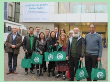
Here's part of the group gathering outside the Medicine Week Congress House

Visit and participate in the famous Baden-Baden Medicine Week Congress